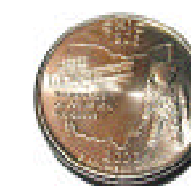
Shown actual size with quarter (when printed at full 13" x 19")